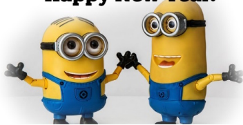
A bridge Player's New Year wish

New Year's Day now is the accepted time to make your regular annual good resolutions. Next week you can begin paving hell with them as usual.